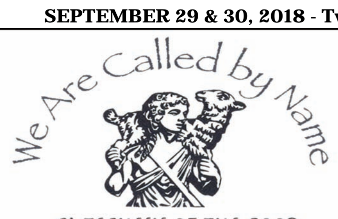
CATECHESIS OF THE GOOD SHEPHERD

The Catechesis of the Good Shepherd (CGS) offers to the youngest children, the most essential aspects of our faith, knowing that these truths will nurture their need to love and be loved and their capacity to enjoy God's presence in their life.