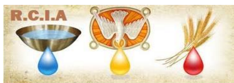
Rite of Christian Initiation of Adults